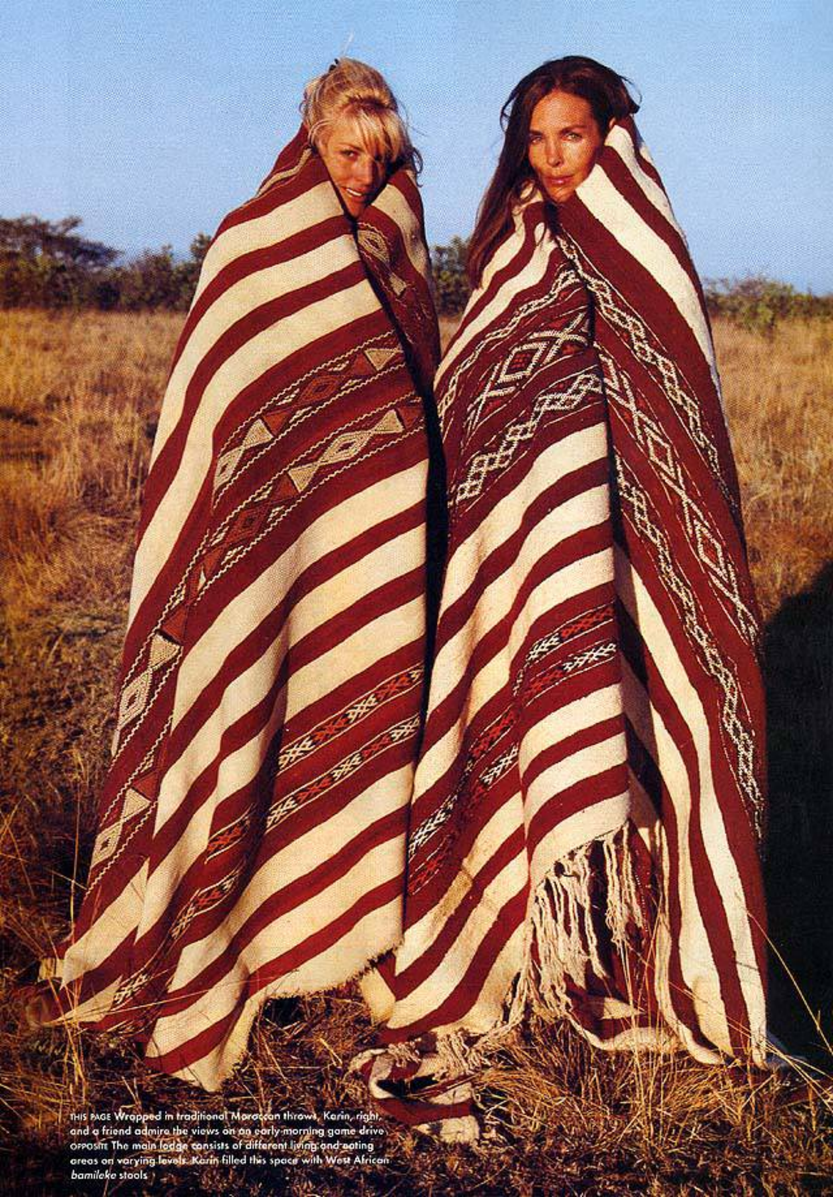
THIS PAGE Wrapped in traditional Moroccan throws, Karin, right, and a friend admire the views on an early-morning game drive OPPOSITE The main lodge consists of different living and eating areas on varying levels. Karin filled this space with West African bamiloke stools